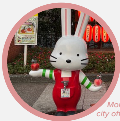
Momo-rin, Fukushima city official character

In summer, Fukushima City is full of color and life. It's peach season, and you'll find peach-themed treats everywhere: peach ice cream, peach parfaits, and even peach drinks!