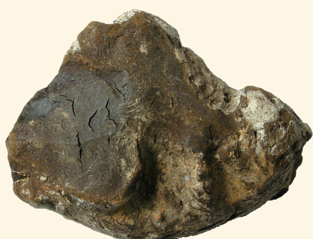
Asphalt containing less impurities