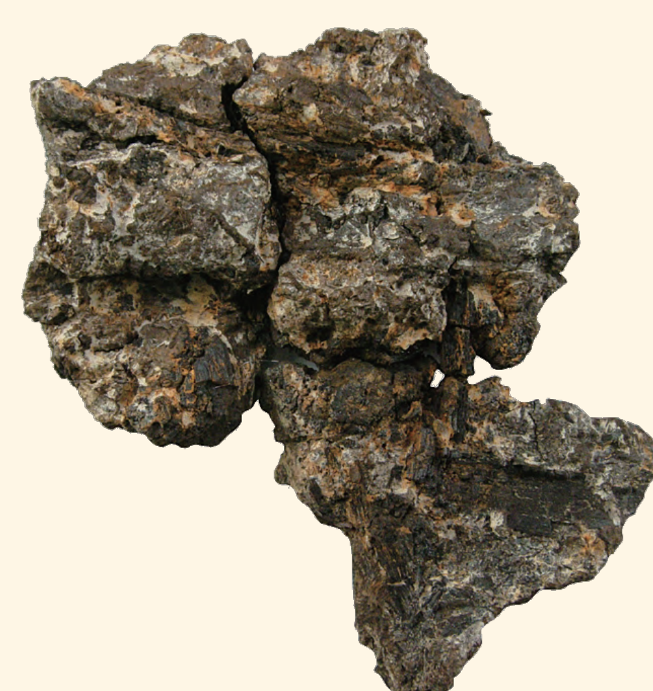
Asphalt containing a lot of impurities (magnified view on the right)