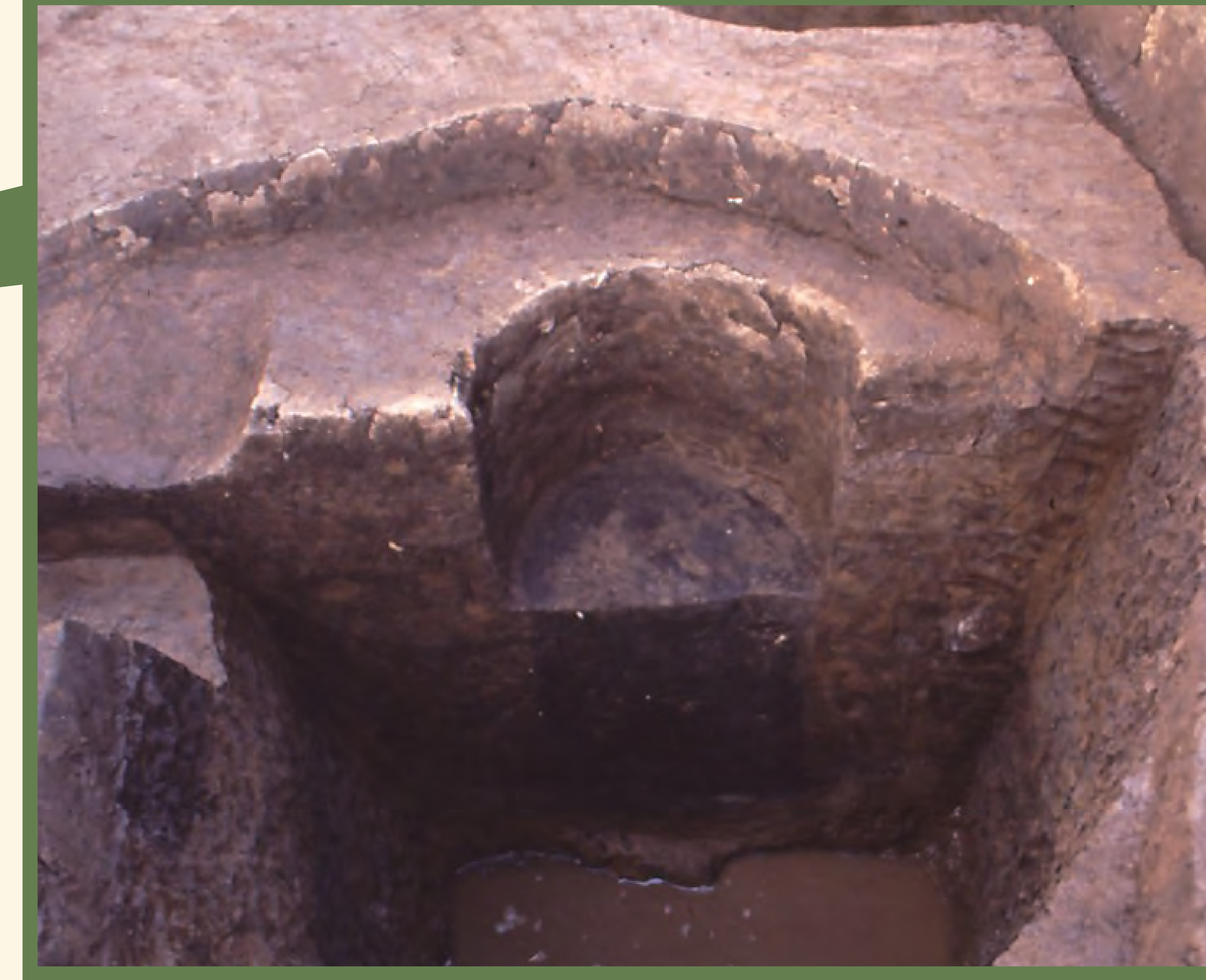
Cross section of the posthole (No. 3 Pit) with the black part showing the trace of a post 90cm in diameter

Floor plan of No.1 Hottatebashira Building