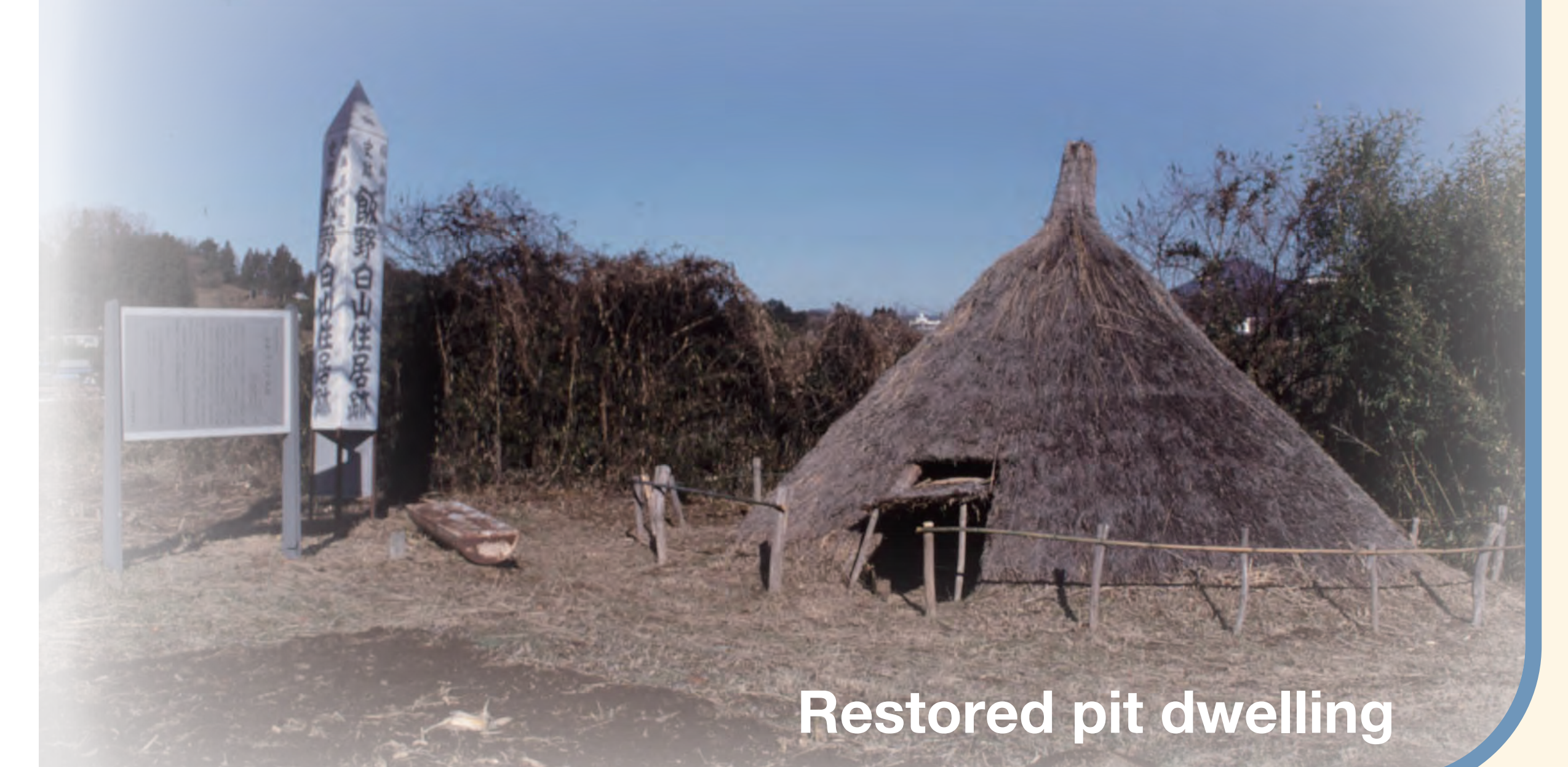
Restored pit dwelling