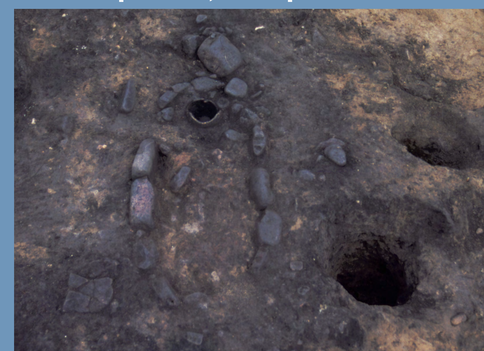
A hearth surrounded by stones with a pottery buried in the ground (Middle period, Tsukizaki Site)

There are various forms of Jomon-period hearths. In the early Middle Jomon period, hearths surrounded by stones with a pottery buried in the ground were generally used; around the late Middle Jomon period, composite hearths, and; in the Late Jomon period, hearths surrounded by stones.