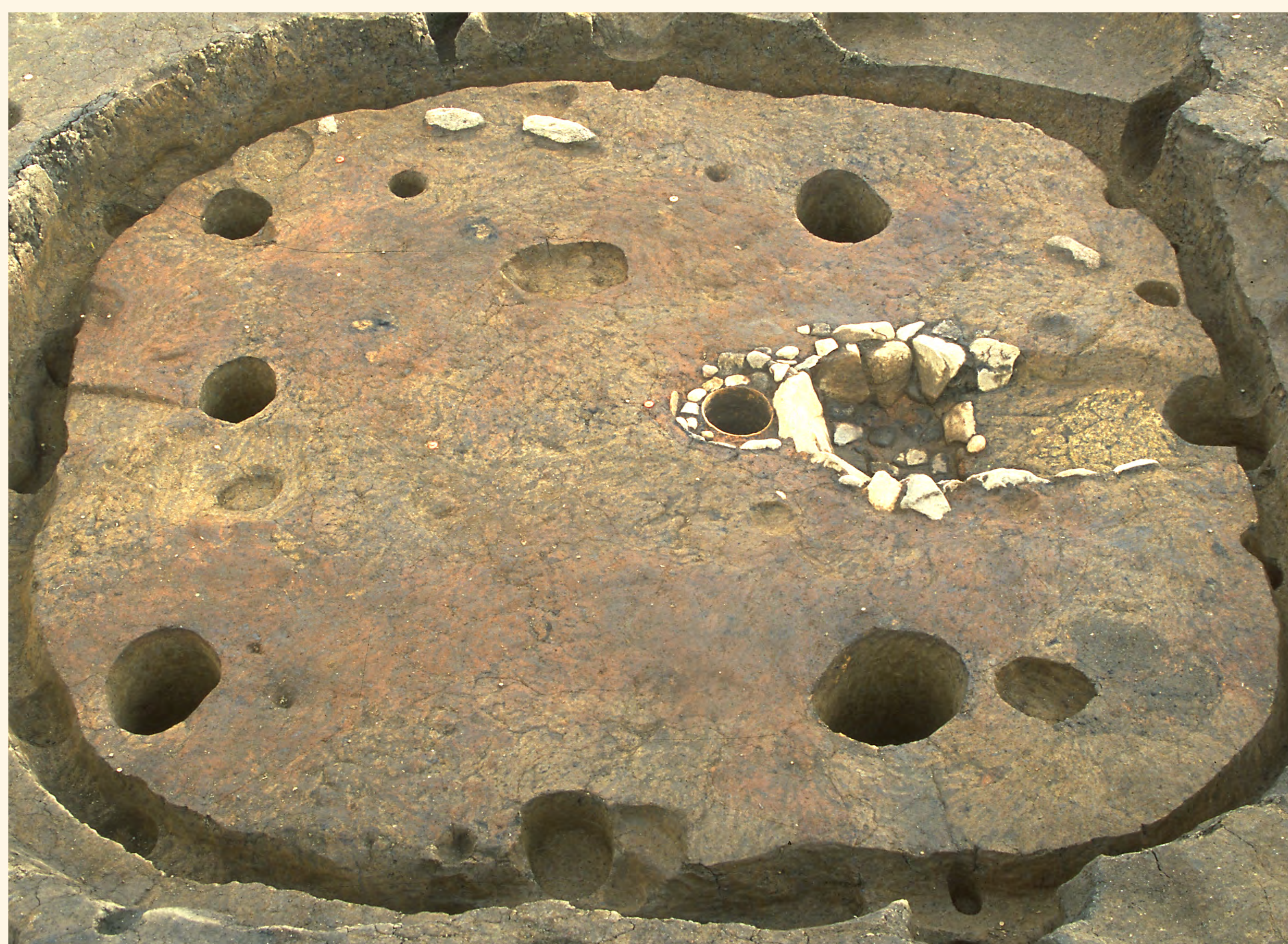
Composite hearths at the Miyahata Site

In villages from the middle period of the Miyahata Site, composite hearths called fukushiki-ro were used. A composite hearth, which is one of the larger-scale hearths in the country, consists of a hearth with a pot buried in the ground and another stone-lined hearth.