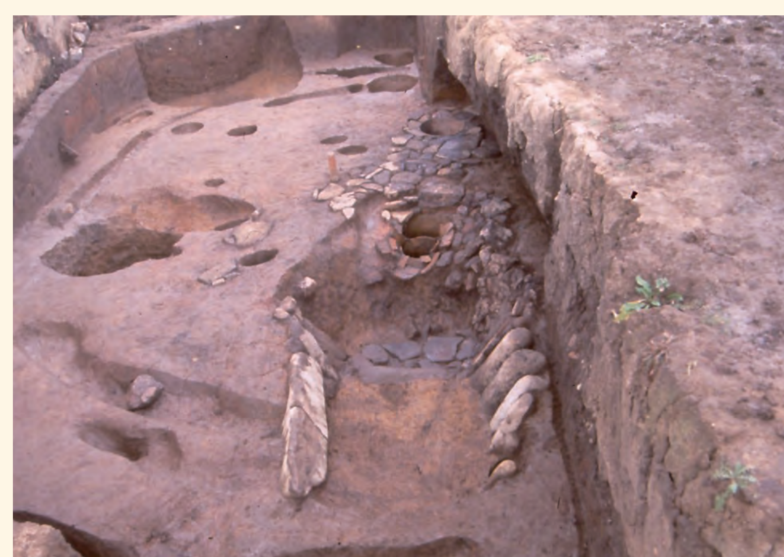
Composite hearths at the Miyahata Site