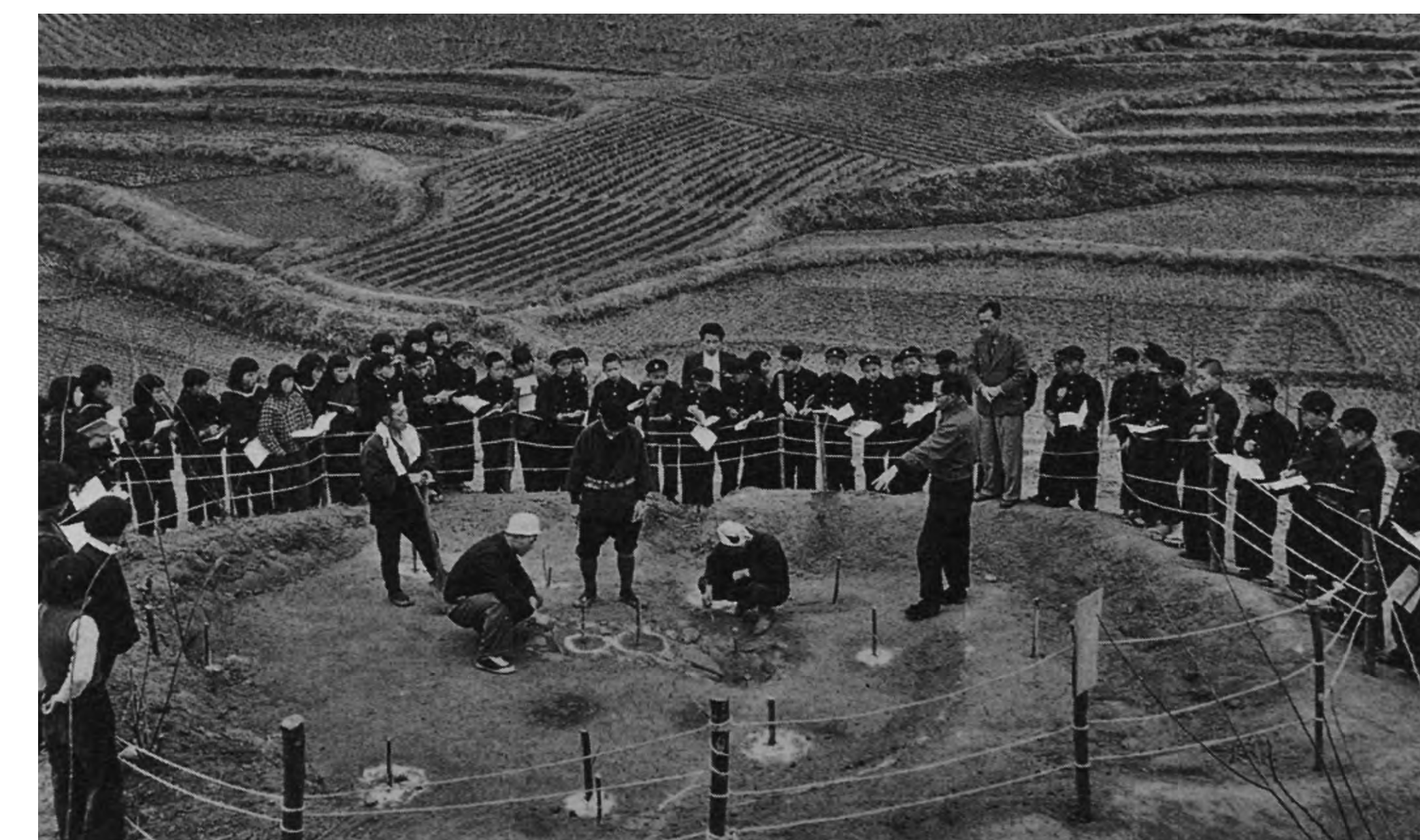
Excavation work in 1957