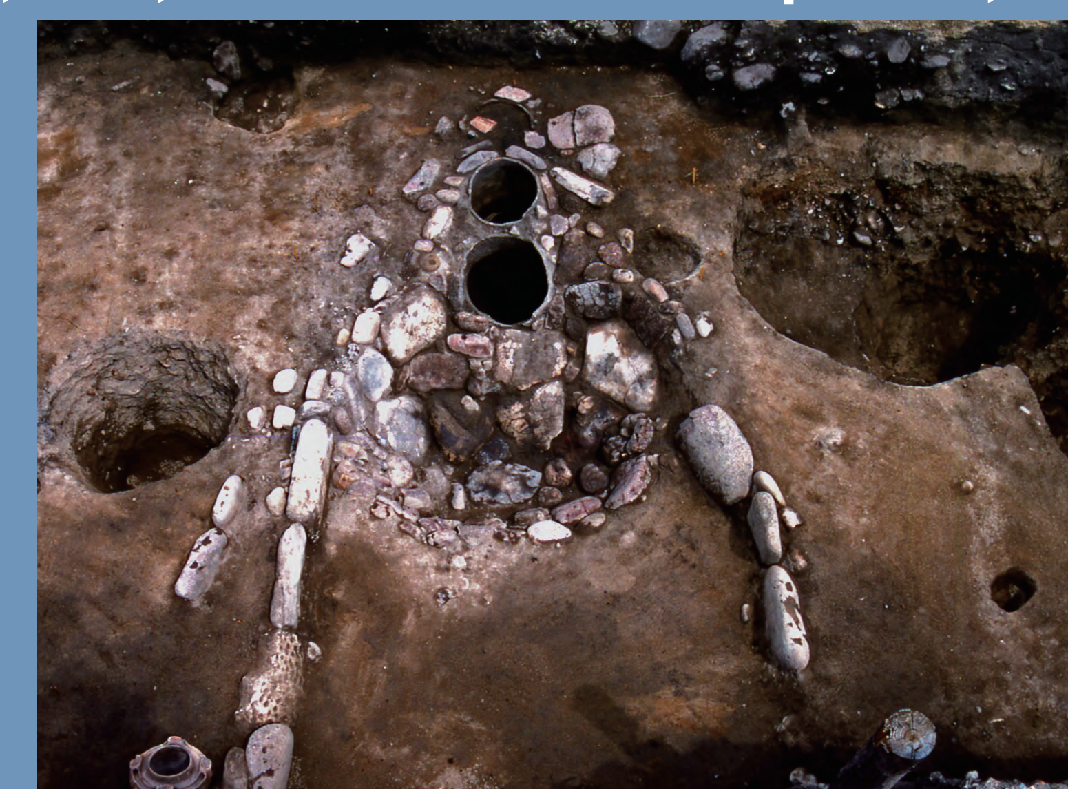
Composite hearths (Middle period, Tsukizaki Site)