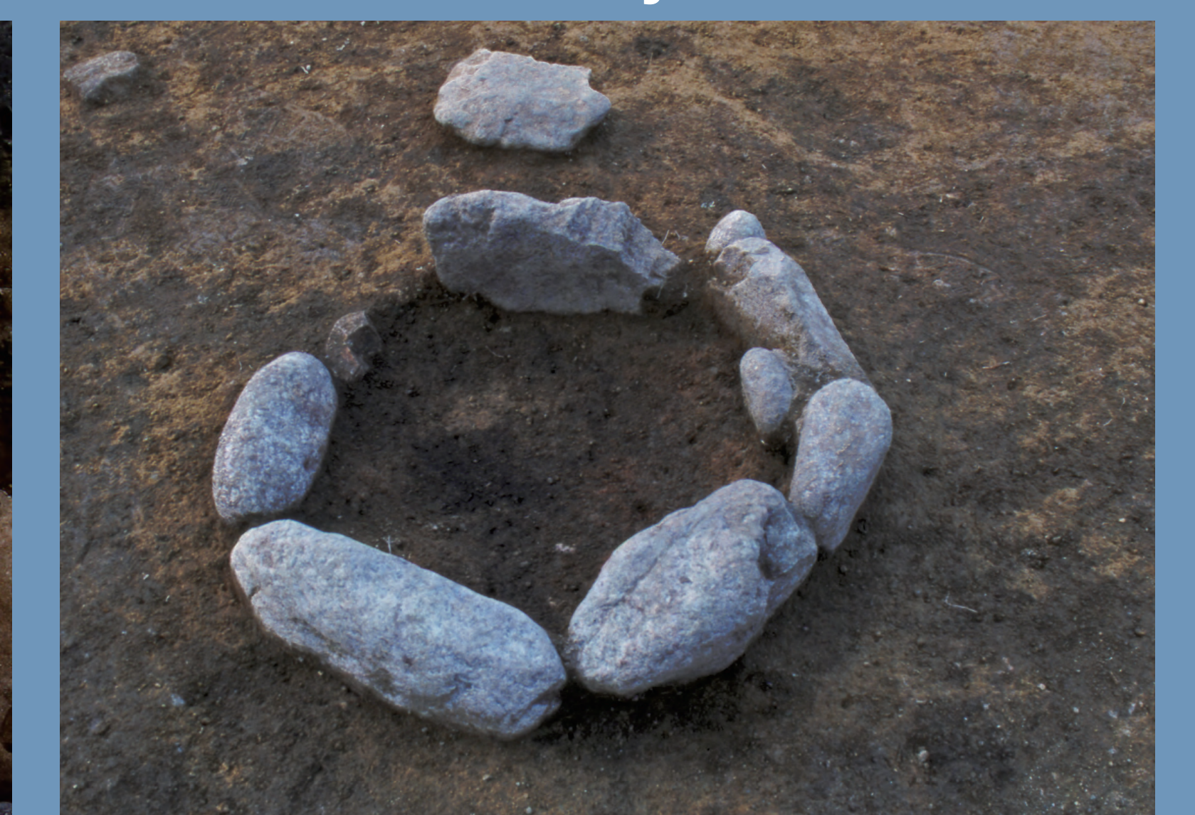
A hearth surrounded by stones (Late period, Komine Site)