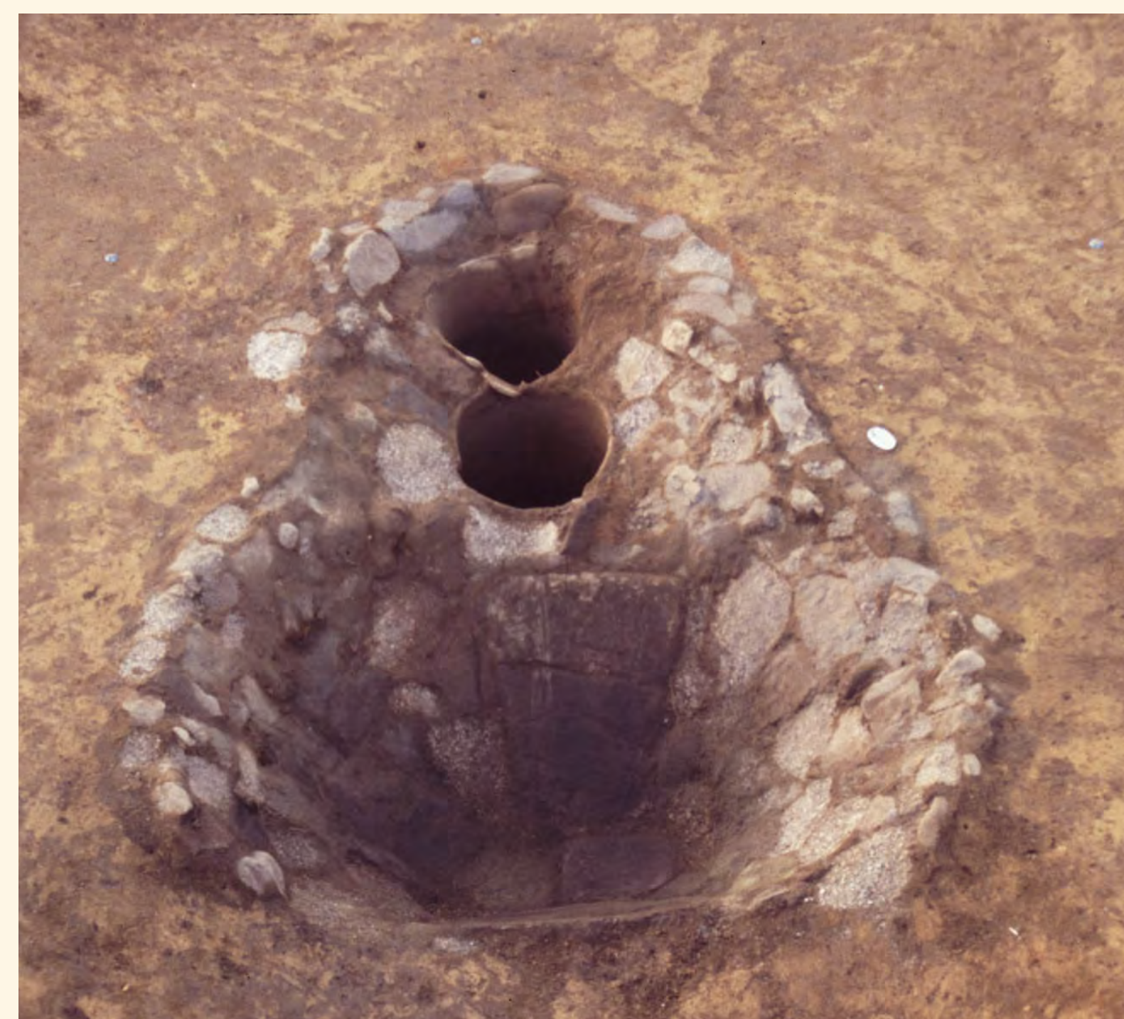
A magnified photo of composite hearths