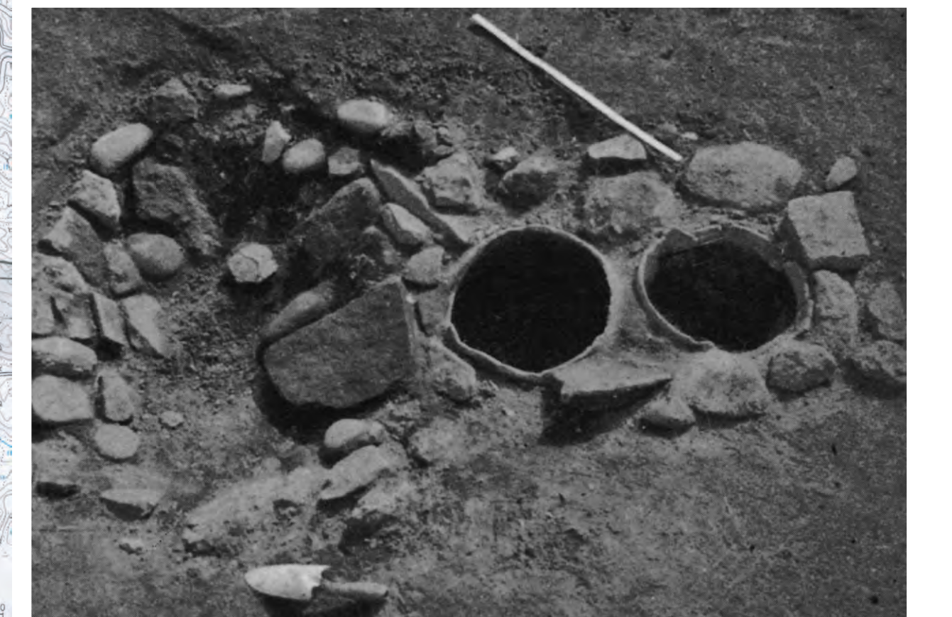
Composite hearths at the Iino-hakusan Site